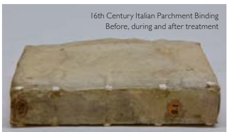
16th Century Italian Parchment Binding Before, during and after treatment